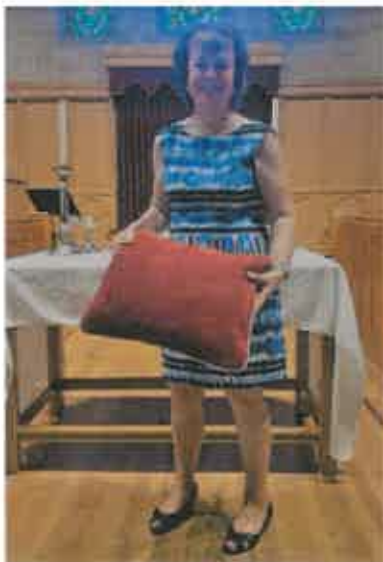
Kneeling cushions for Ordination Sunday.