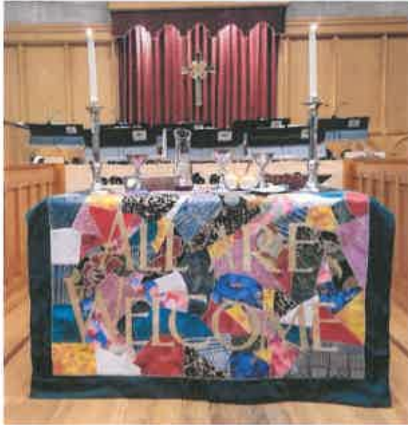
Tablecloth created for World Communion Sunday.