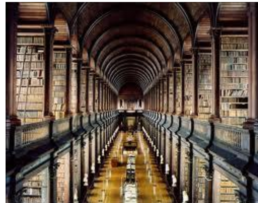
Trinity College Library