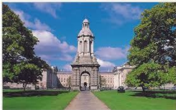
Trinity College Dublin, Founded 1592 by Queen Elizabeth I

Fri 12 Oct Morning service in St Patrick's Anglican Cathedral. Mission opportunity to follow. Afternoon free for shopping, or peruse the classic engravings in the Book of Kells at Trinity College. Dinner, bed and breakfast in the Ashling.