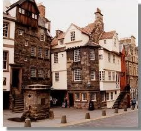
John Knox House, on the Royal Mile