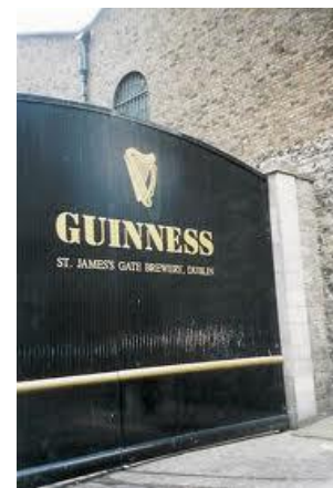
St. James's Gate at the Guinness Brewery