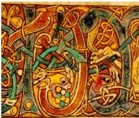
Engravings from the Book of Kells, ca. 800 (Trinity College Library)