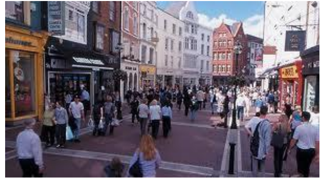
Wonderful Grafton Street

Fri 12 Oct Morning service in St Patrick's Anglican Cathedral. Mission opportunity to follow. Afternoon free for shopping, or peruse the classic engravings in the Book of Kells at Trinity College. Dinner, bed and breakfast in the Ashling.