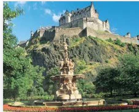
Edinburgh Castle, at the head of the Royal Mile

Mon 8 Oct Morning transfer from hotel to Edinburgh airport for the 55 minute FlyBe flight to Belfast City airport, only 4 miles from the city centre. On the way into town you will pass the Harland & Wolff shipyard, home of the Titanic, whose centenary falls this year. First a visit to the ornate Belfast City Hall for a tour and lunch, followed by a visit to and more mission opportunities at the Belfast Central Mission of the Methodist Church. Dinner, bed and breakfast at one of Belfast’ best-known hotels, the four star Europa – just opposite the Crown Bar, the only pub in the British Isles owned by the National Trust as a national treasure.