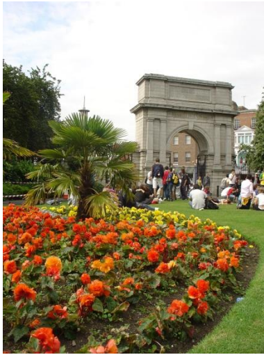
St. Stephen's Green