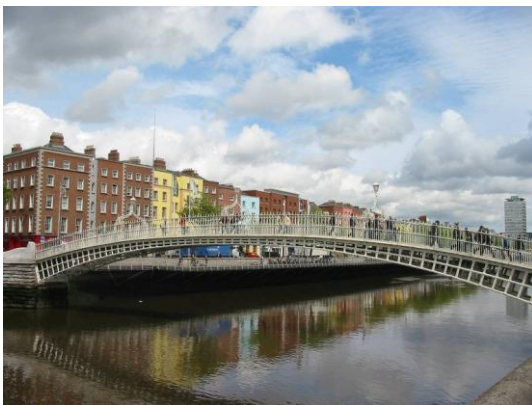
The Haypenney Bridge on the River Liffey

Thu 11 Oct Morning 3 hour journey through the lush Irish countryside to Dublin for a short city tour and then afternoon check in at the four star Ashling Hotel, just across the River Liffey from the Guinness factory. Dinner and “Irish Nights” together in a typical Irish pub. Get ready to dance and sing!