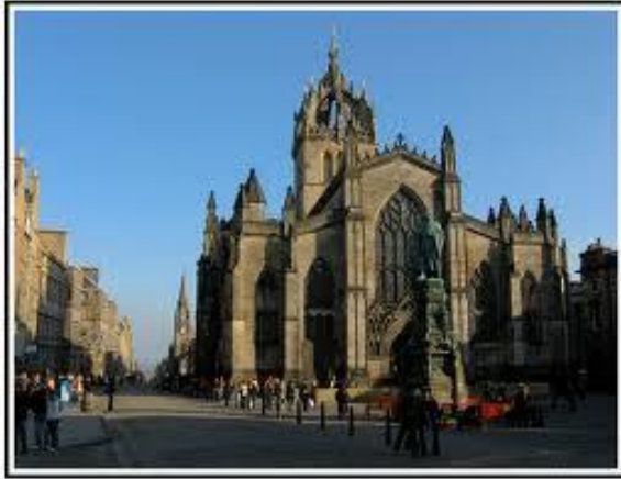
Kirk of St Giles, Edinburgh

Sun 7 Oct Morning worship at the Kirk of St Giles (Mother-Church of Presbyterians); John Knox House, and the Royal Mile, and afternoon excursion to the beautiful Rosslyn Chapel., ca. 1456. This little gem was made famous, more recently, in the book/film “ The DaVinci Code. ” DBB at the Premier Travel Inn.